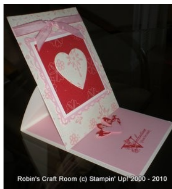
A2 Sized Card