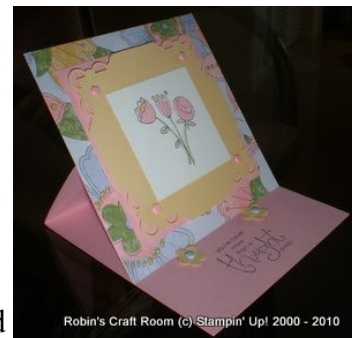
4" Square Card